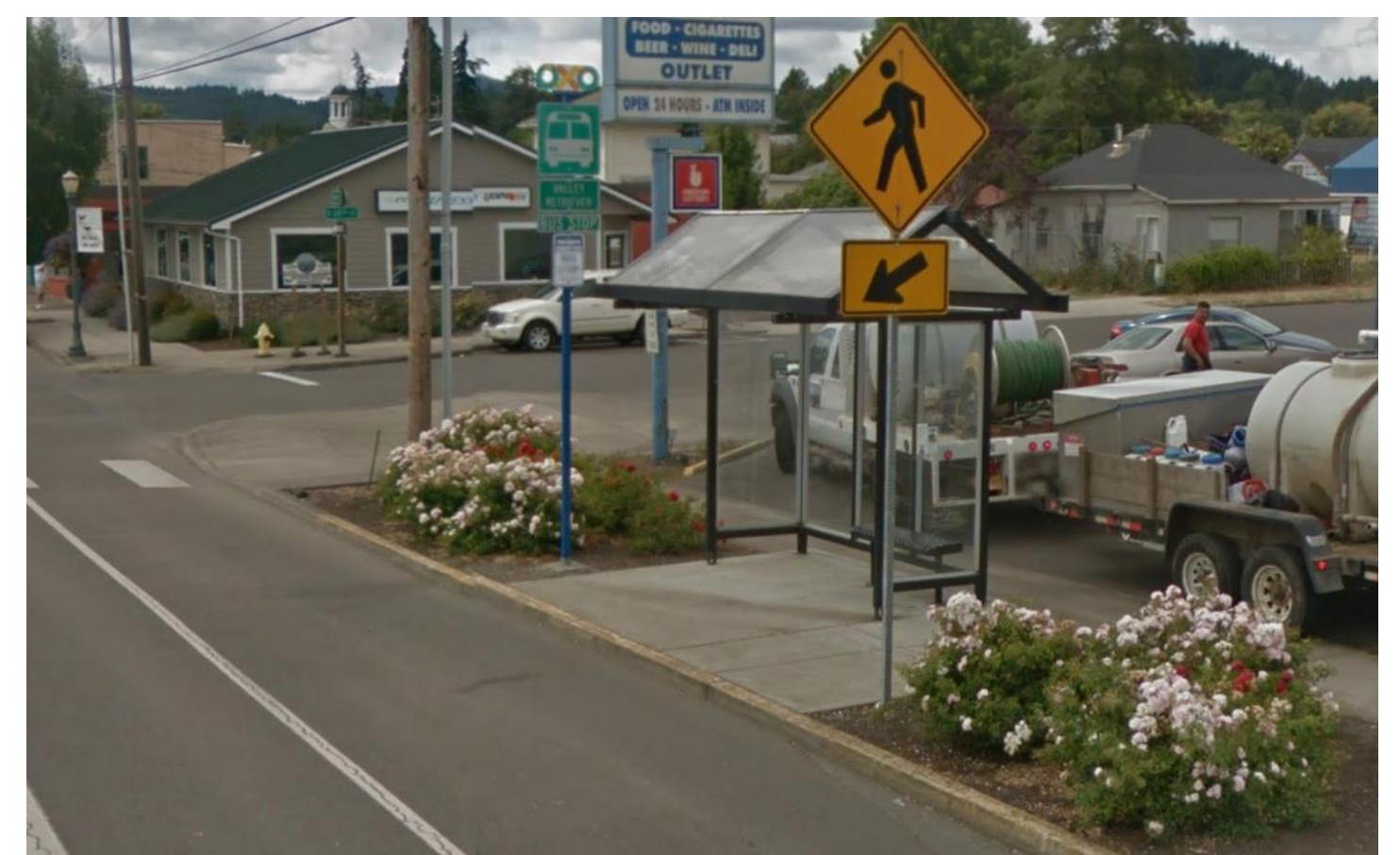
Philomath Connection bus and bus stop with shelter at Main St / N. 14 th St.